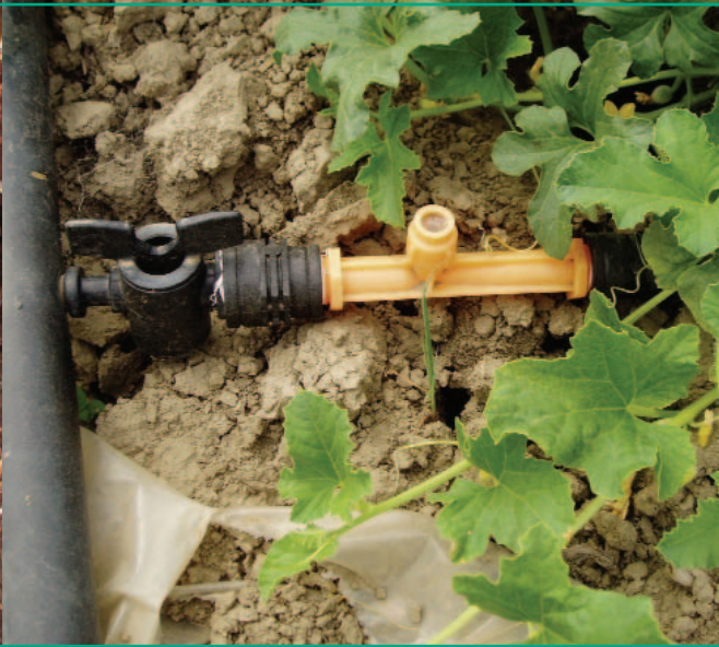
All pictures courtesy of Prof. I. Sri

S ub-surface drip Irrigation is defined as "application of water below the soil surface through emitters, with discharge rates generally in the same range as drip irrigation." Because it protects soil structure and aeration, sub-irrigation is considered a rational technique for supplying water to open field crops. Moreover, the method allows enlarging the irrigated surfaces as a consequence of the low maintenance costs. The technique can be carried out both in extensive and intensive cropping systems. In the first case, the height of the groundwater table is controlled by introducing water into the drains. The pre-requisites to extensive sub-irrigation are: a superficial groundwater table, the presence of an impermeable layer into the soil profile, and a high soil hydraulic conductivity. In the intensive cropping systems, plastic pipelines are laid near the plant roots. Water diffusion into the soil depends on texture characteristics: it is high in clay and low in sandy soils.